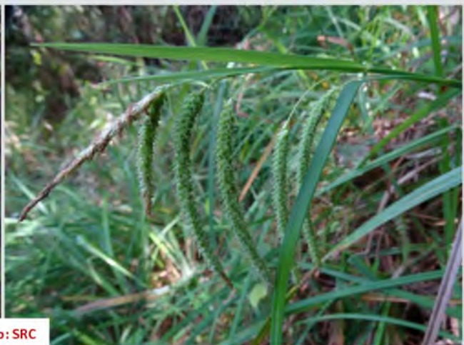
Carex phacota (Poaceae)