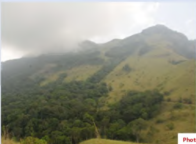
Panoramic view of Muthukuzhivayal Kanyakumari WLS