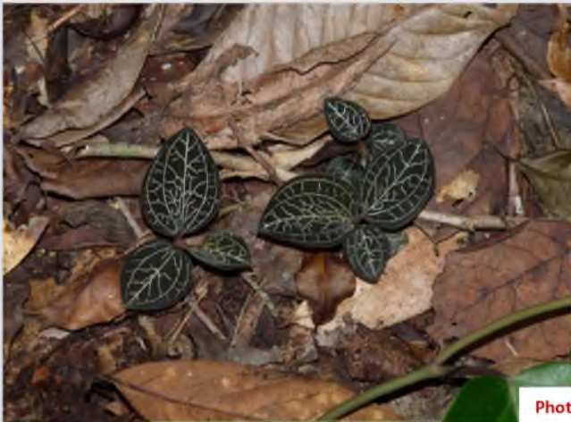
Anoectochilus elatus (Orchidaceae)