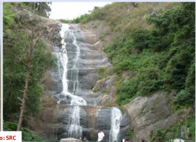
Silver cascade falls near Kanyakumari WLS