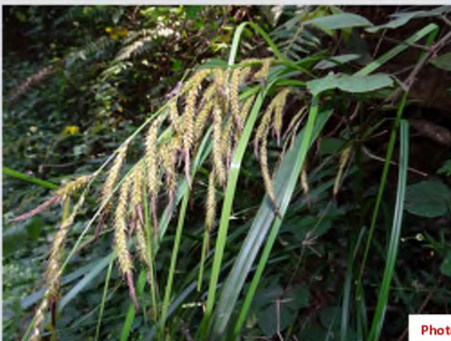
Carex myosurus (Poaceae)