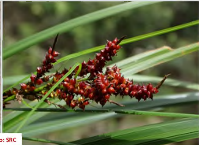
Carex baccans (Poaceae)